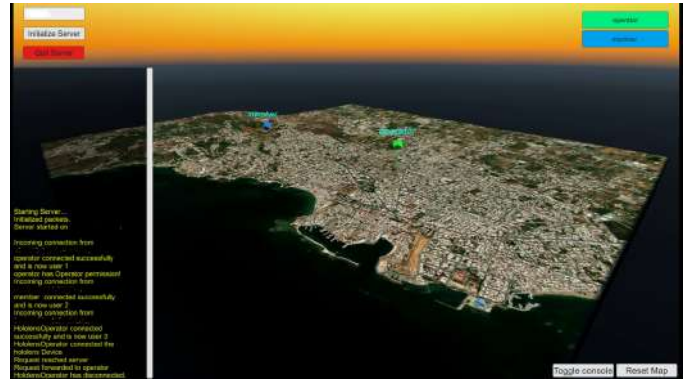
Figure 3: Live Tracking System server screenshot

representation of each member's location on a 3D map that is easily controlled by the PC operator. For the application to acquire GPS data from the Android devices' GPS receiver, a plugin for Unity was implemented using Android Studio accessing native Android data and, thus, is more reliable than the libraries Unity offers. The user interface (UI) of the Android application installed on the firefighting team members' mobile phone consists of three screens: