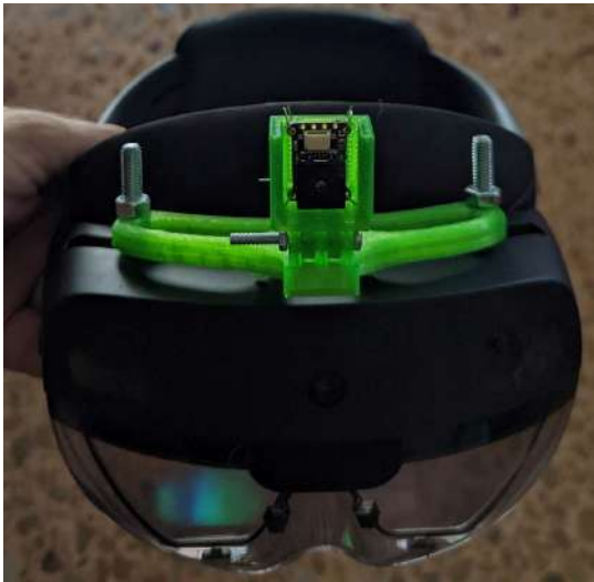
Figure 1: 3D printed case housing FLIR Lepton 3.5 on Hololens 2