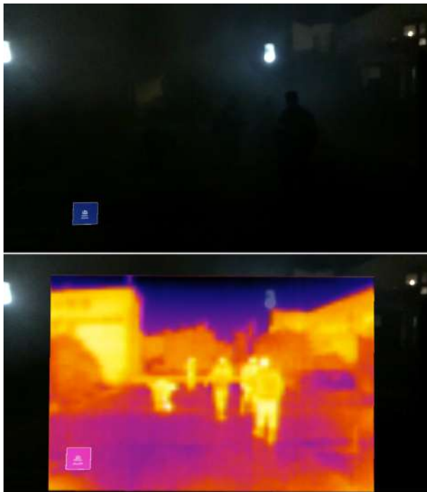
Figure 5: Thermal Imaging System on Hololens 2

A smoke grenade was activated outdoors. A connection between the server (PC) and client (Hololens 2) applications was established and the streaming was successful. The Hololens 2 operator recognized and tracked human figures on the landscape, through the thick smoke produced by the smoke grenade, as well as the environment and the buildings surrounding them (Figure: 5).