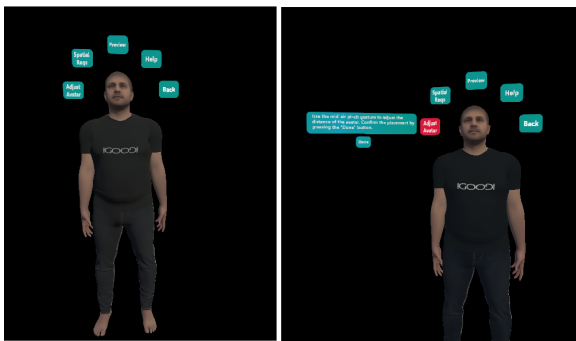
Figure 4: Avatar-Oriented Interface. Information is expanded upon user input away from the central view

the UIs are oriented around the avatar, expanding at the desired level of information based on user input, without obstructing the user's central view (Figure 4) to avoid hindering physical tasks. Utilizing the device's eye tracking, gaze input is incorporated in the interaction for a hands-free experience, while compensating for the distance between the user and the avatar. The following functionalities are available via the UIs: a) patients adjust the avatar's position for a comfortable view, b) in order to ensure safe spatial requirements for each exercise protocol, virtual annotations, such as a virtual corridor on the ground, are displayed providing adequate space for gait c) before they perform the exercise, patients witness the correct exercise execution by the avatar through predefined animations. During exercise performance, their movement is reflected on the avatar via the pose estimator. Utilizing the outcome of posture assessment, the system displays intuitive digital visual cues referencing specific limb areas where exercise execution should be improved. While textual instructions are available to the user, visual indication regarding situated information about exercises or patients' performance are available during idle states.