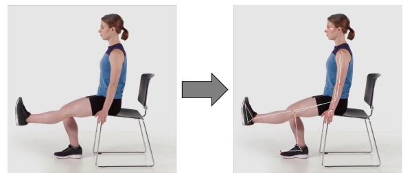
Figure 3: Example body landmarks extracted from an RGB image frame by Mediapipe.

The 3D pose estimation module is based on computer vision detecting in real-time 3D poses for rehabilitation assessment. The module receives input from external RGB cameras set to one or two combined and supports the creation of animations of the depicted users in order to have realistic visualization of movement in AR, facilitating monitoring by the physiotherapist providing feedback. In both one- and two-camera setups, the camera(s) must be static. It is essential to ensure that the entire body of the subject remains visible during the exercise. In the two-camera setup, the optimal angle between them should be determined based on the size of the installation space, ranging from 30 to 60 degrees. Two processes are executed in this module: firstly, the extraction of 3D body landmarks, e.g. points on a human body identifying the human pose, implementation based on Mediapipe. An example knee exercise is illustrated in Figure 3. The second process is the mapping of the landmarks onto the target 3D avatar described in subsection 3.3.